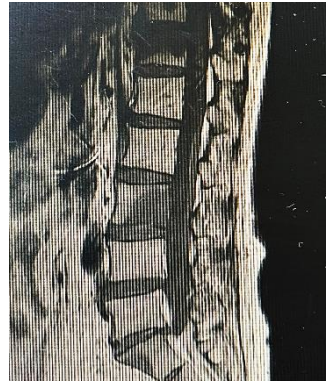
Figure 1. Pre-Kyphoplasty Sagittal MRI Of The Lumbar Spine Showing Vertebral Compression Fractures At L2-L4 With Metastatic Involvement and Spinal Canal Narrowing

Histopathological analysis of biopsied tissue confirmed thoracolumbosacral metastases originating from left axillary apocrine adenocarcinoma, with predominant involvement of thoracic vertebrae 9 and 12 and lumbar vertebra 3. The primary tumor origin remained uncertain but was suspected to be the previously diagnosed axillary carcinoma. The patient received multimodal management, including pain control, hepatic nodule evaluation, and spinal bracing to reduce mechanical strain. Additional therapy included palliative radiotherapy and intravenous zoledronic acid (Zometa) to mitigate osteolytic activity associated with metastatic bone disease.