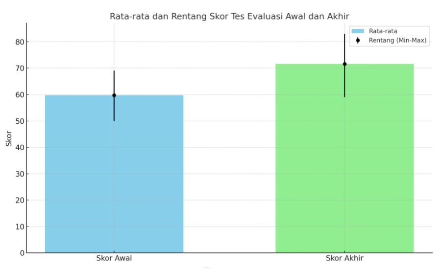
Diagram 1. diagram illustrates the average scores of participants before and after the program

The results of this activity indicate that most participants from the targetd community are able to understand the basic concept of the overlay brick method. This is indicated by an increase in scores on the pre and post evaluation tests given. The diagram below shows the participant knowledge improvement.