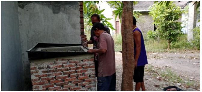
Fugure 1. active community participation

The picture below shows active community participation, especially in the process of collecting waste and preparing compost tools.