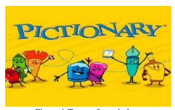
Figure 1 Types of vocabulary

According to Folse (2008), there are five types of vocabulary: single word, set phrase, variable phrases, phrasal verbs, and idioms, Single word is the most widely used word. Then from that, every student should know a lot of single words. Students need about 2,000 words to speak, 3,000 words to read texts, and 10,000 words to enter the academic world.