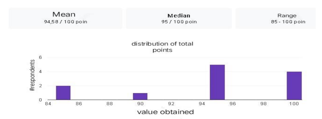
Figure 3. Results of post-test Scores

Figure 3 shows the results obtained during the post-test. Based on the data in the figure, it is known that the average score of Madrasah Diniyah Taklimiyah Awwaliyah Al Barkah students during the post-test was 94.58.