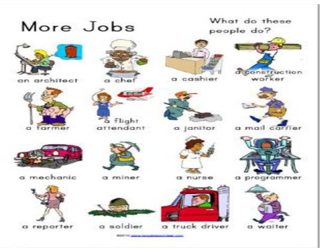
Pictuter 3. Jobs

1) Pictures can motivate the students and make them want to pay attention and take part.2) Pictures contribute the context in which the language is being used. They bring world into classroom street, scene or particular object; 3) Pictures can be described in an objective way, interpreted, or responded to subjectively; 4) Pictures can cue responds to question or cue substitution through controlled practice; 5) Pictures can stimulate and provide information to conversation, discuss and storytelling.