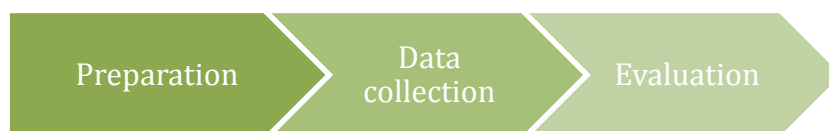
Figure 1. Training stages

This training to use Google Site as online Academic Diary was conducted in one Senior High School in Bandarlampung, namely SMA Islam Global Surya. The trainer team consisted of English literature lecturer and students. This team was responsible to give introduction of Google Site and to give the training on how to create and use Google Site as online Academic Diary. The method used in this training was qualitative measurements using the questionnaires to determine students’ perception toward the use of the Google Site as online Academic Diary. The stages of this training flow starting from preparation, data collection, and evaluation are shown in Figure 1.